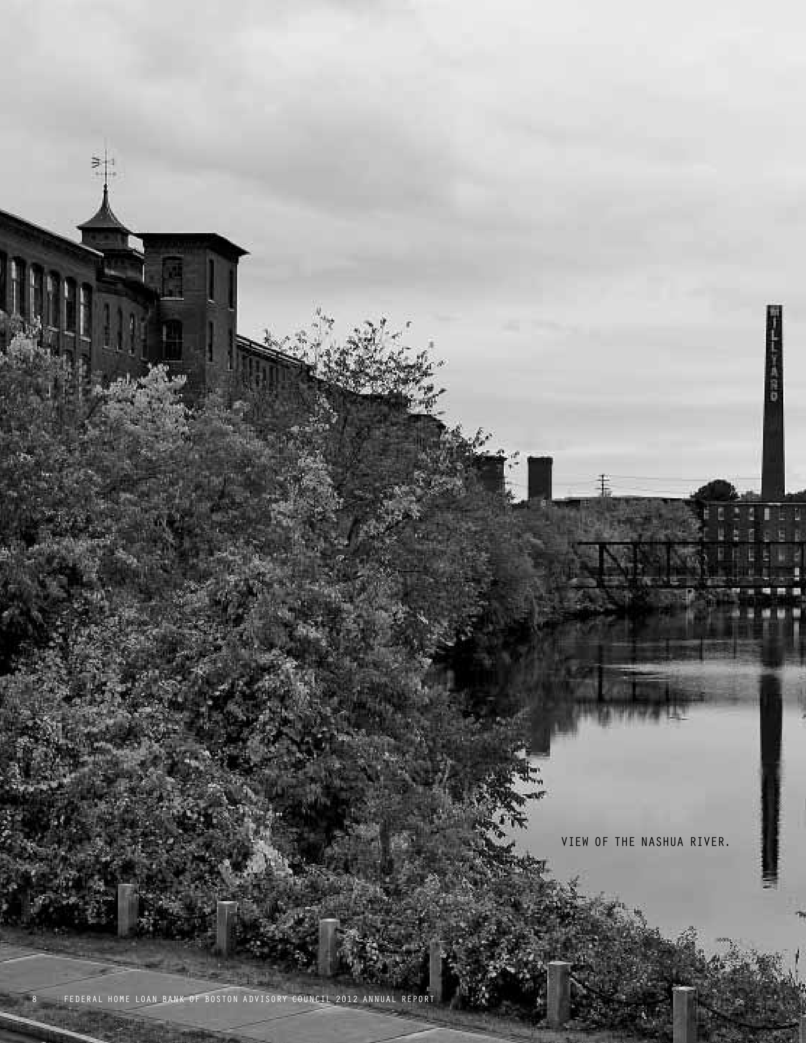
VIEW OF THE NASHUA RIVER.